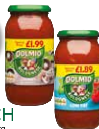
NOW 94P EACH Dolmio Bolognese/Bolognese Extra varieties as stocked 500g PMP £1.99/£1.89/Std