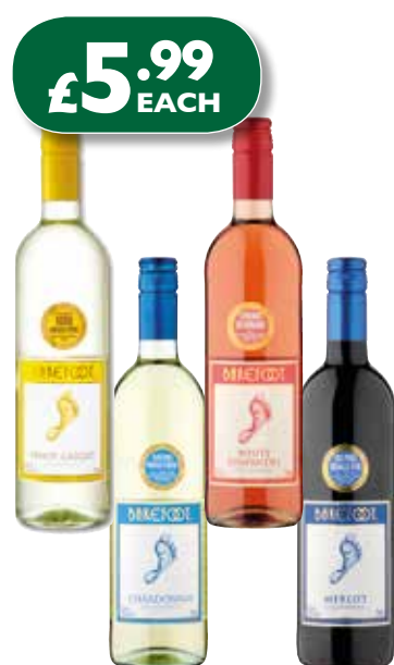
Barefoot White Zinfandel/Pinot Grigio/ Chardonnay/Colombard Chardonnay/Sauvignon Blanc/Merlot 75cl