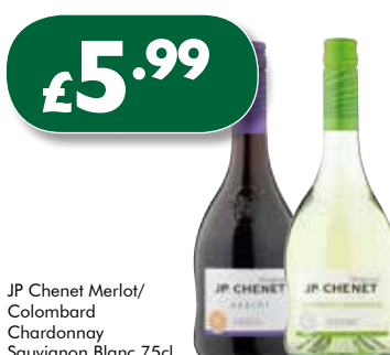
JP Chenet Merlot/ Colombard Chardonnay Sauvignon Blanc 75cl