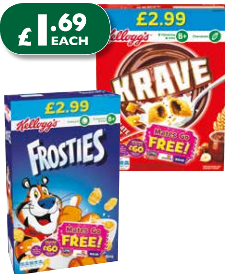
Kellogg's Frosties/Krave 500g/375g PMP £2.99