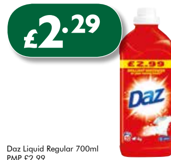
Daz Liquid Regular 700ml PMP £2.99