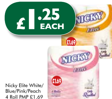
Nicky Elite White/ Blue/Pink/Peach 4 Roll PMP £1.69