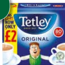
Tetley Tea 80s PMP £2