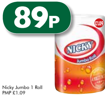
Nicky Jumbo 1 Roll PMP £1.09