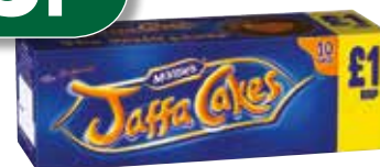
McVitie's Jaffa Cakes 122g PMP £1