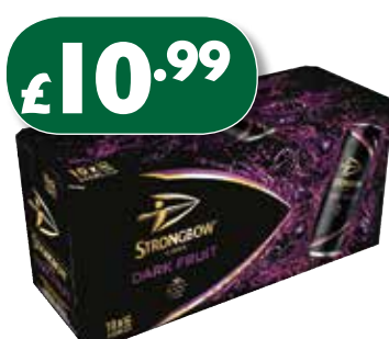
Strongbow Dark 10x440ml