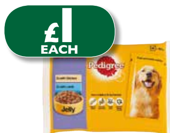
Pedigree Dog Pouches Chicken/Lamb in Jelly/ Chicken & Veg/Beef & Veg in Gravy 4x100g