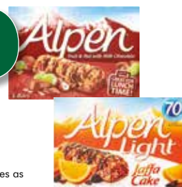
Alpen Multipack Bars varieties as stocked 5 x 19g/29g