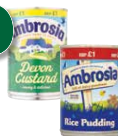
Ambrosia Custard/Rice 400g PMP £1