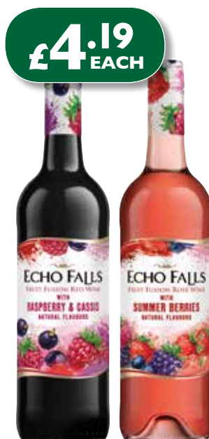
Echo Falls Fruits Summer Berries/ Peach & Mango/Raspberry Cassis 75cl