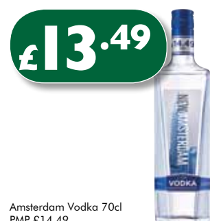
Amsterdam Vodka 70cl PMP £14.49