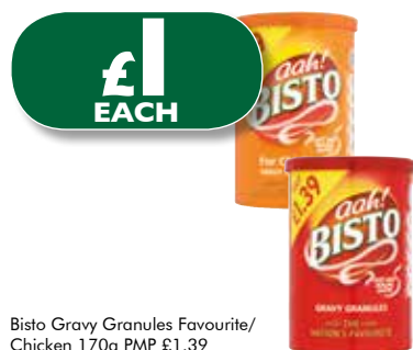
Bisto Gravy Granules Favourite/ Chicken 170g PMP £1.39