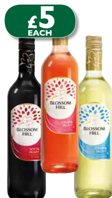
Blossom Hill Classic Red/White/Rose 75cl