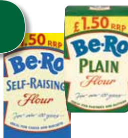
Be-Ro Flour Plain/ Self-raising 1.25kg