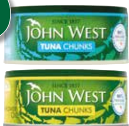
John West Tuna Chunks in Brine/Sunflower Oil 145g