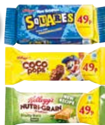
Kellogg's Cereal Bars varieties as stocked 28g-45g PMP 49p