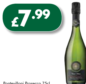
Pontevilloni Prosecco 75cl