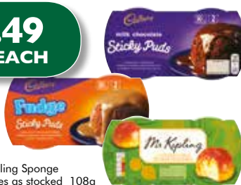
Cadbury/Mr Kipling Sponge Puddings varieties as stocked 108g