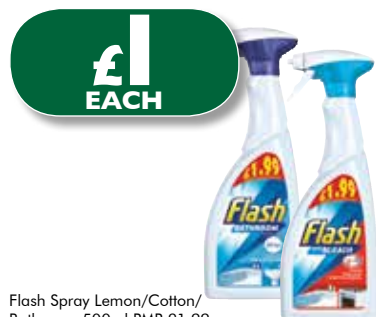
Flash Spray Lemon/Cotton/ Bathroom 500ml PMP £1.99