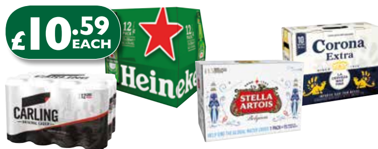
Carling/Heineken/Stella Artois/Corona/10x330ml /12x330ml/440ml/15x284ml